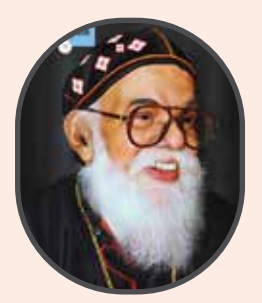
പൗലോസ് മാർ ഗ്രിഗോറിയോസ് 18–ാം ഓർമ്മ, നവംബർ–24 (പഴയ സെമിനാരി)