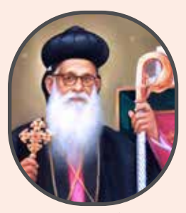
തോമാ മാർ ദിവന്നാസിയോസ് 42–ാം ഓർമ്മ, നവംബർ–3 (പത്തനാപുരം ദയറ)