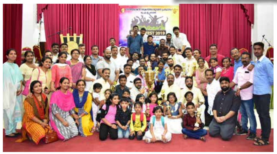
OCYM UAE Zonal Youth Fest Sargolsavam 2019 - St. Thomas OCYM Dubai Unit has won the Overall Championship. Heartfelt Congratulations to all our Participants.